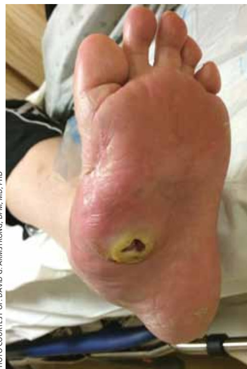
FIGURE 5 Charcot neuroarthropathy