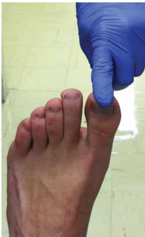
FIGURE 3 The Ipswich Touch Test