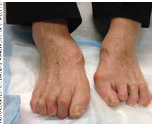
FIGURE 4 Claw toe